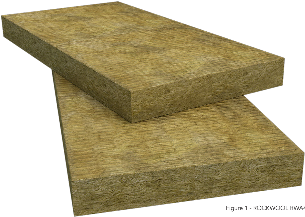
Figure 1 - ROCKWOOL RWA45